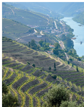
QUINTA DOS MALVEDOS

As a result of the adjustments to the picking plan, each vineyard at Malvedos and Tua was picked at optimal ripeness. The Valdossa vineyard, high above the Malvedos estate house, produced superb grapes from its 30-year-old Touriga Nacional, their maturity delivering wines of