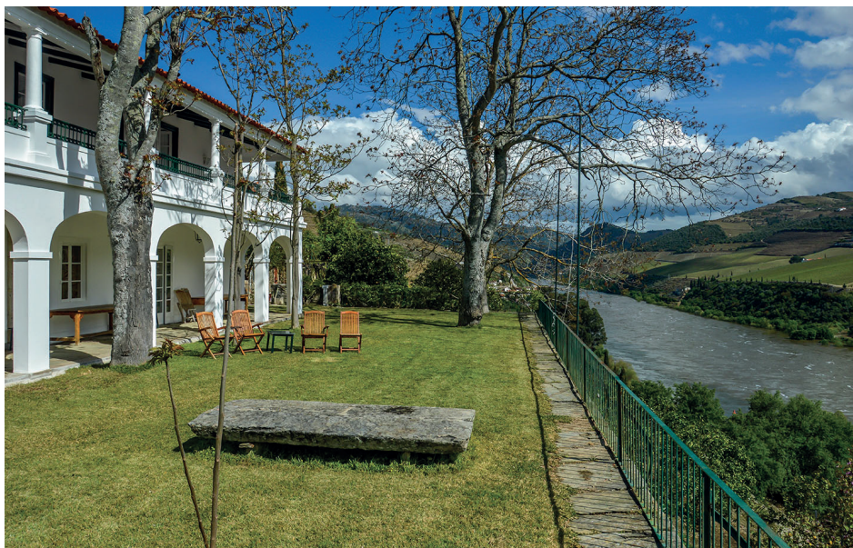
QUINTA DOS MALVEDOS, MARCH 2016: THE RIVER DOURO, SWOLLEN BY THE ABUNDANT WINTER RAINFALL