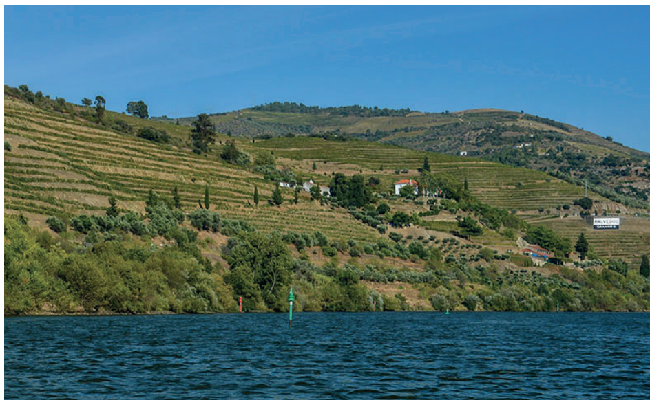
QUINTA DOS MALVEDOS: THE VINEYARD VIEWED FROM THE RIVER

Two quintas owned privately by members of the Symington family, Vila Velha and Vale de Malhadas, contributed small parcels of excellent quality grapes. At Vila Velha, the Vinha da Barca contributed its finest Touriga Nacional and Touriga Franca, which were co-fermented to capture the full expression of this west-facing riverside vineyard. At Vale de Malhadas, the production from the barely half a hectare sized Vinha dos Eucaliptos vineyard provided elegant floral aromas from Touriga Franca grapes.