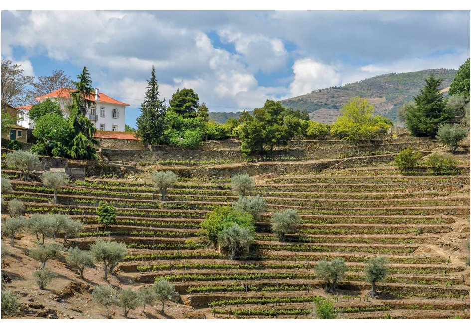
THE CARDENHOS VINEYARD, BEHIND THE HOUSE

The 'Cardenhos' Stone Terraces, which form an amphitheatre behind the quinta house are northeast facing and the Port Arthur terraces, around the ridge on which the house stands, face east. This is in complete contrast to the predominantly south-facing vineyards which make up most of the Malvedos vineyard. The Stone Terraces cooler orientations came into play in this extraordinarily dry and