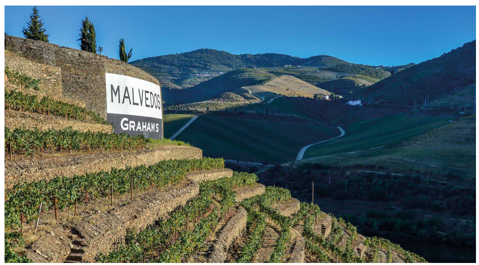
THE STONE TERRACES AT MAI VEDOS

A relatively rare phenomenon in the Douro today due to their prohibitively high construction and maintenance costs, these schist-walled terraces, with their unique ability to store the sun's daytime heat through the nocturnal hours, bring considerable benefits in the final stages of ripening.