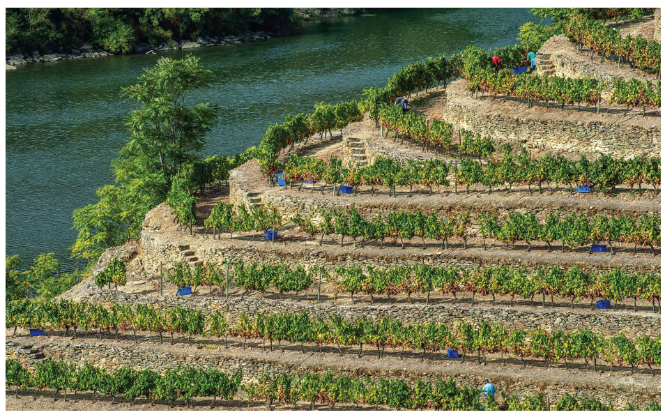
PARCEL 43 OF THE 'PORT ARTHUR' STONE TERRACES