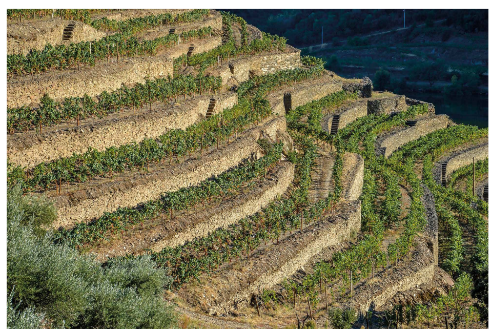
THE IMPRESSIVE STONE TERRACES AT MALVEDOS