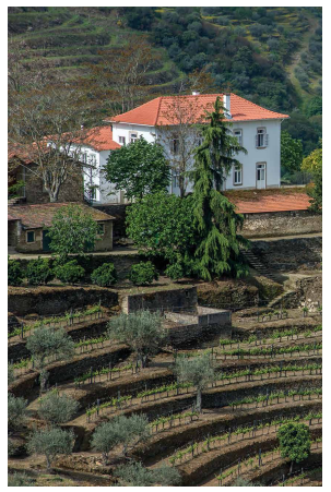
THE CARDENHOS VINEYARD

Extraordinary scents of orange blossom and rockrose, with notes of pine needles and bergamot in the background. The palate is opulent and seductive, revealing mesmerising concentration and incredible intensity without detracting from the wine's exceptional structure and balance. Very fine acidity provides remarkable freshness, which reflects the cooler east and northeast facing stone terraced vineyards at Malvedos. This wine has to be tasted to be believed.